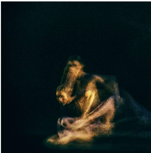
Zdeněk Sokol, untitled, from the PARADISE series, 150 × 150 cm

Zdeněk Sokol (1965, Prague) is a graduate of the Prague School of Photography and of FAMU's Department of Photography. He currently works as a photographer for the National Theatre. Sokol has held solo exhibitions at many prestigious galleries and institutions, including the project Paradise in the lobby of the National Theatre's New Stage in Prague (2022). He has also exhibited at a number of group exhibitions: LA Art Show, Los Angeles (2020); 1989 , National Gallery Prague (2019); Images of the Ends of History: Czech Visual Culture 1985–1995 , Museum of Decorative Arts, Prague (2019); Shakespeare in Photography , Supreme Burgrave's House, Prague Castle (2003); and Olgoj Chorchoj + Zdeněk Sokol , Moravian Gallery, Brno (1995); and with the Bratrstvo art group: Czech and Slovak Photography of the 1980s and 1990s , Museum of Modern Art, Olomouc (2002); Moravian Gallery, Brno (1996); Czech Center, Berlin (1995); Prague House of Photography, Prague (1993); Galerie mladých, Brno (1991); Semafor Theatre Exhibition Hall, Prague (1989); and Kounicovy koleje, Brno (1989). Zdeněk Sokol's work can be found in a number of public and private collections in the Czech Republic and abroad, including the Museum of Decorative Arts in Prague, the Moravian Gallery in Brno, and the Museum of Modern Art in Olomouc.